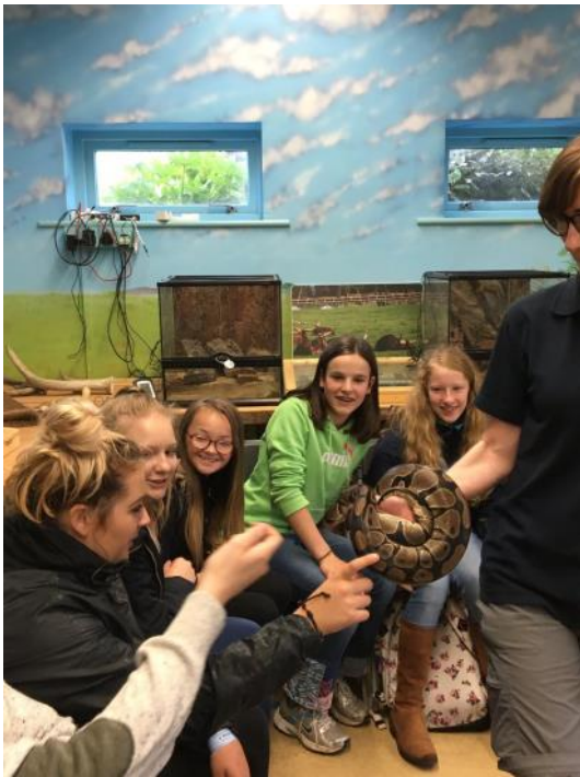
Year 8s take over Knowsley Safari!