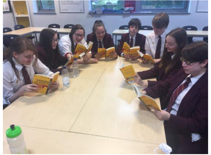
Great to see the Year 9 Advanced Learner Readers Club up and running!