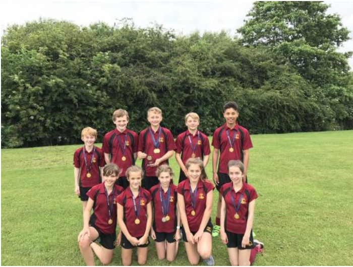
Congratulations to the Yr7 team who finished in 1st place in the Macclesfield "Quads Kids" competition.