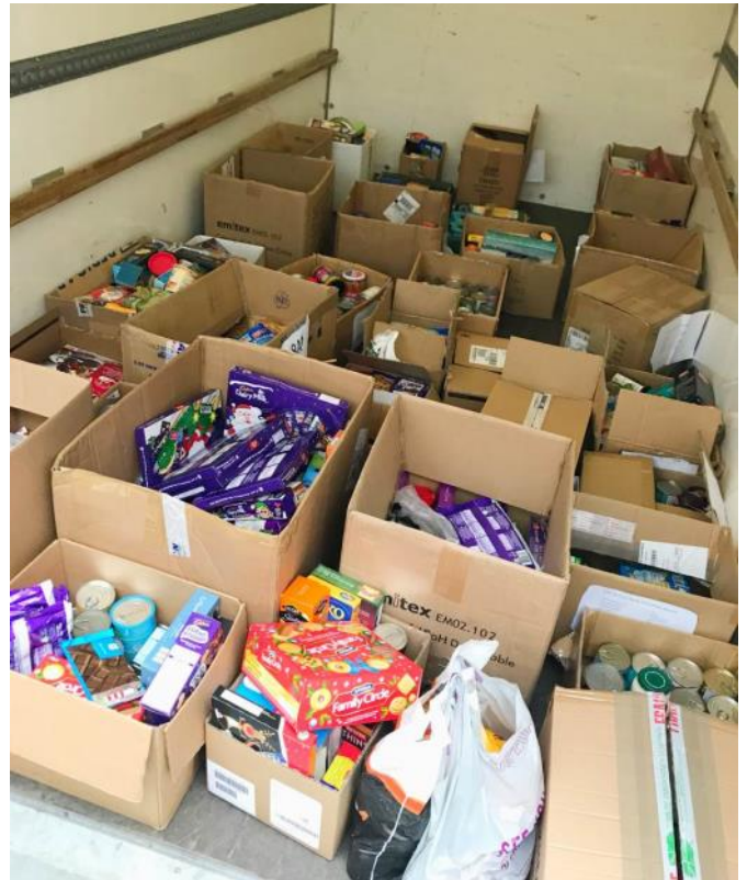
We donated loads of items to the local food-bank.