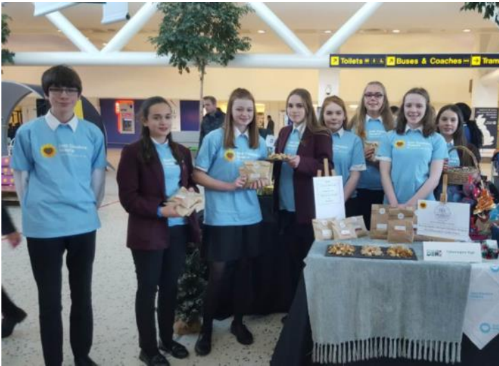
Our Dragons Den selling event at Manchester Airport today, they made over £280